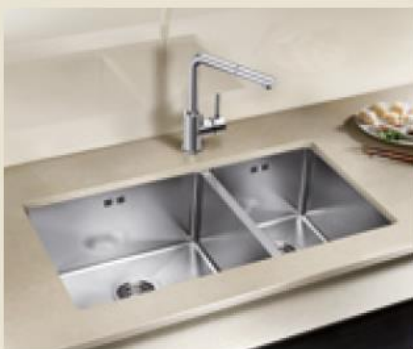
Double the comfort: BLANCO QUATRUS R15 435/280-IU.