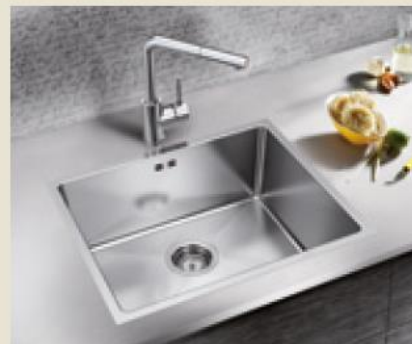
Installation from above is ideal for worktops made of laminate.

What is particularly practical is that all the bowls in the BLANCO QUATRUS R15 family are suitable both for undermounting and for installation from above, and so can be fitted in any worktop.