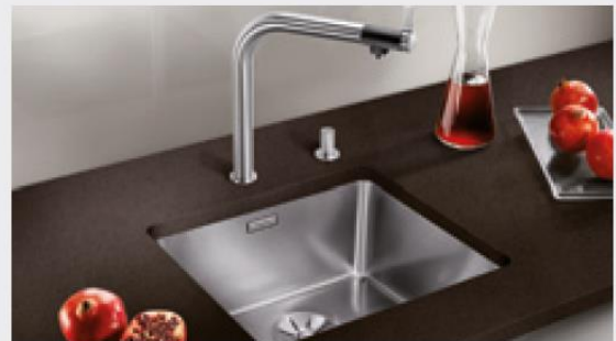
BLANCO ANDANO 450-U, stainless steel