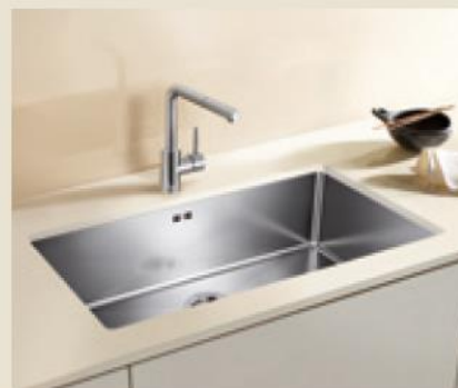
The eye-catching drain grooves in the base also add visual accents.

BLANCO QUATRUS R15-IU is a versatile bowl programme for the most diverse requirements.