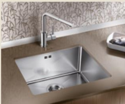
For worktops made of natural or artificial stone: the QUATRUS family for undermounting.

The eye-catching drain grooves in the base not only add a visual accent, but also emphasise the functionality of the bowl.