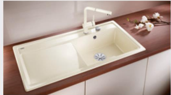
BLANCO ZENAR XL 6 S, Ceramic PuraPlus™